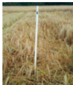
Ceriax @ T2