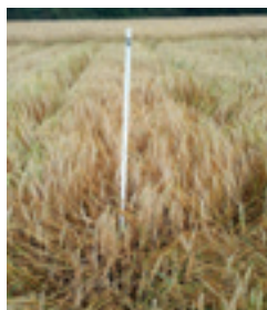
ELATUS™ Era @ T2